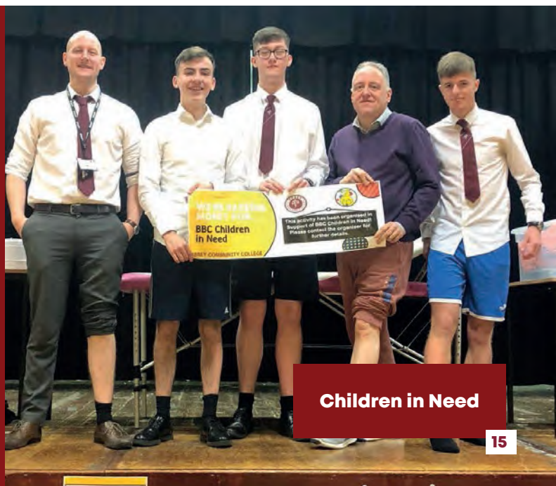
Children in Need