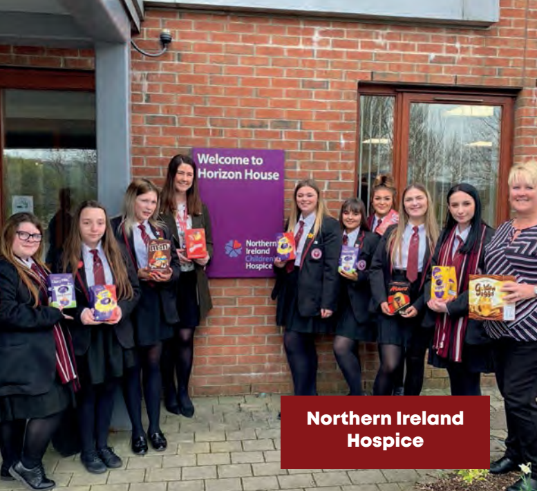
Northern Ireland Hospice