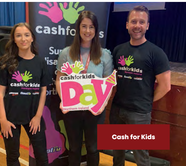
Cash for Kids