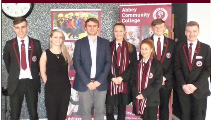
Welcoming guests from Price Waterhouse Coopers (PWC)