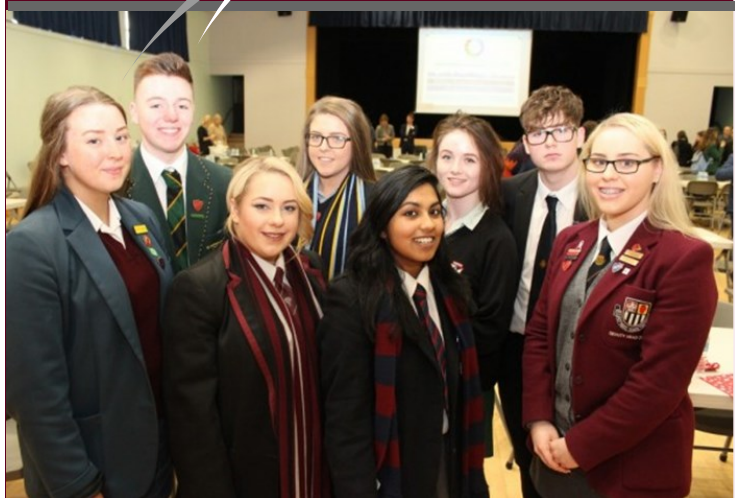
RE class attends NBALC post-16 symposium