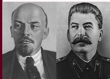
AS Unit 2 Russia

You will have the opportunity to develop your skills and increase your self confidence through researching, organising information, having a questioning approach to the evidence before you, arguing a case, reaching balanced conclusions based on the evidence and writing in a clear and coherent way. These are transferable skills which are highly desired by employers and will help you in further education to succeed in your chosen career as well as in everyday life.