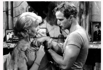
As Unit 1: The Study of Drama

You will have the opportunity to develop your skills in reading and interpreting meaning, critical thinking and analysis of technique. Students who choose English Literature learn about the influences which shape the texts they study and develop the ability to express their own opinions and responses to what they read. You will develop your writing skills to produce arguments in a coherent and convincing way. These are transferable skills which are highly desired by employers and will help you in further education, to succeed in your chosen career as well as in everyday life.