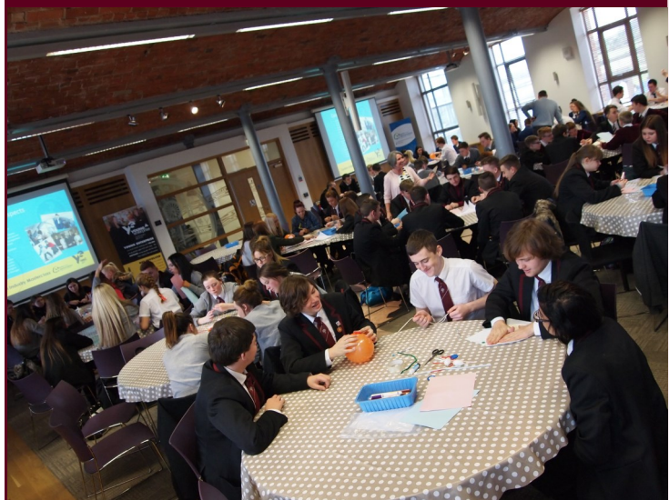
Travel and Tourism Students at Global Entrepreneur Competition