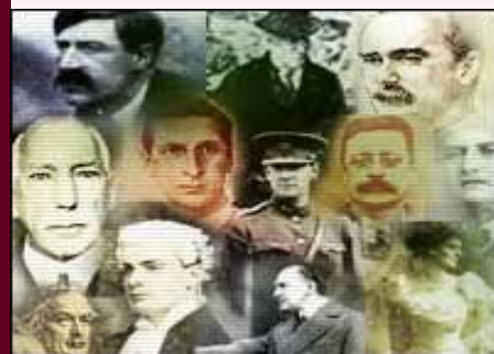
A2 Unit 2 The Partition of Ireland