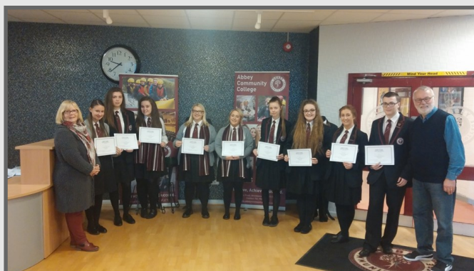
Sign Language class receiving certificates