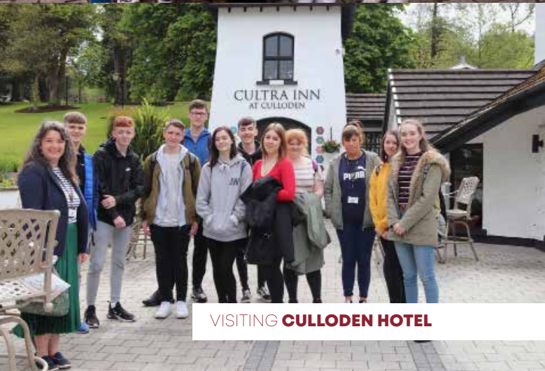
VISITING CULLODEN HOTEL