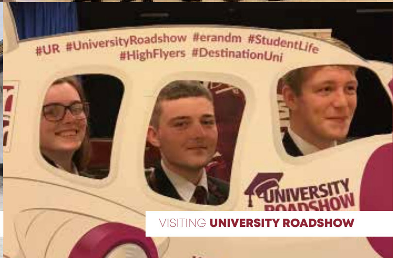
VISITING UNIVERSITY ROADSHOW