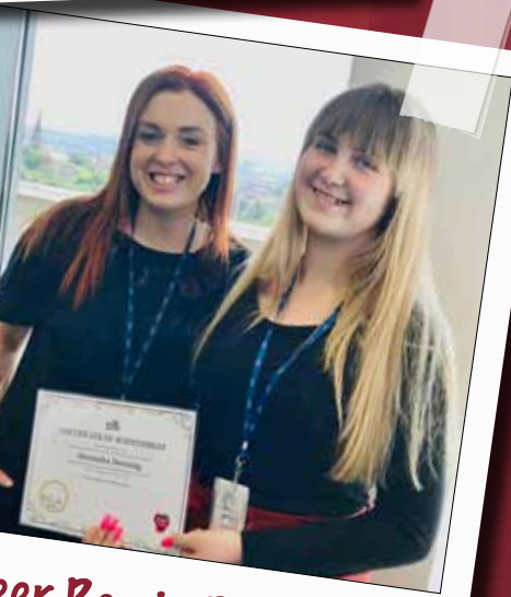
Career Ready Programme